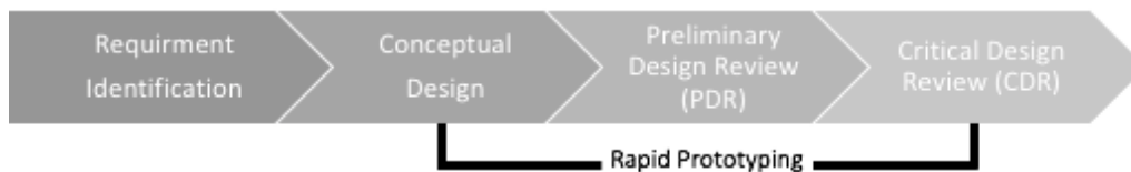
Figure 2. Design challenge project sequence

The objective of the project was to prepare students for industry-based design practices which generally occur prior to detailed prototyping and/or production manufacturing. Each team had to deliver a mind map, preliminary design review (PDR), and critical design review (CDR).