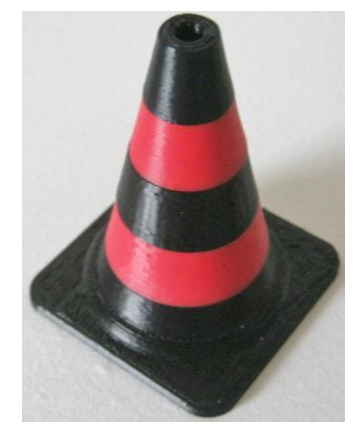
Figure 3. 3D Printed Object Using Additive Technology

In addition, all groups were asked to complete the MCT instrument 2 days prior to the completion of the sectional view drawing to identify level of visual ability and show