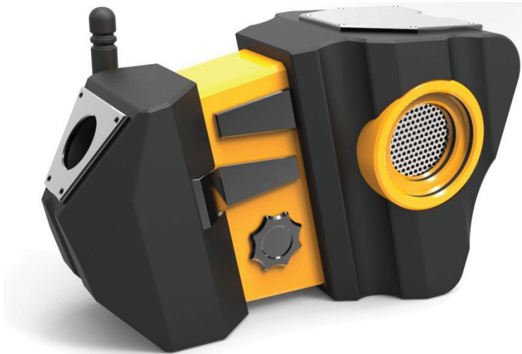
Figure 3. Example of student's CAD model derived from key sections.